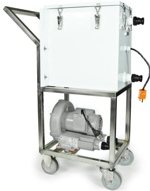
Dimensions: 17" L x 14" W x 35" H Weight: 80 lbs.

The ClorDiSys SCT combines both a Mix Box and Recirculation Blower to form a single, portable system to interface with any equipment that has minimal connection ports such as supply and exhaust HEPA Filter Housings and Biological Safety Cabinets (BSCs). The Mix Box, along with the included connection TEEs and 1-1/4"ID hoses supply the means by which to inject and sample chlorine dioxide gas and humidity into these closed systems and the regenerative blower provides a method of circulation through the system. All connections utilize standard 1" Banjo fittings. The SCT can be wired for both 120 and 220 VAC applications.